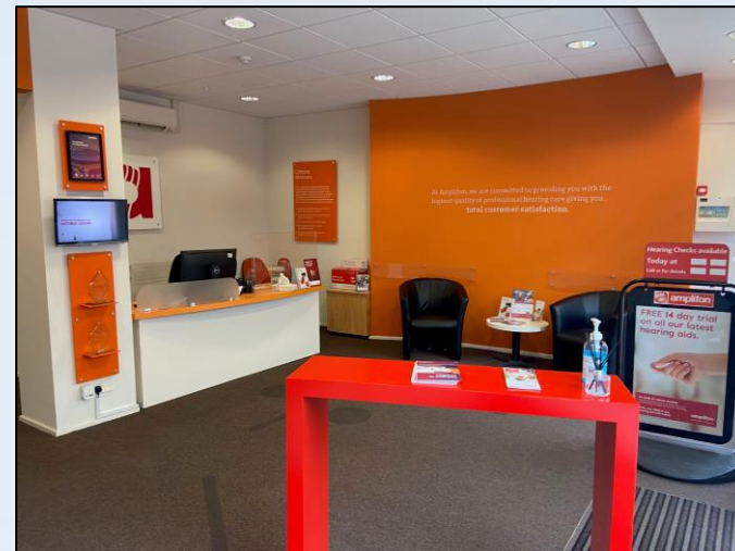
GF Retail Unit