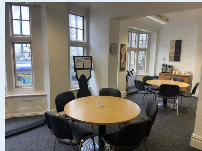
Upper Floor Offices